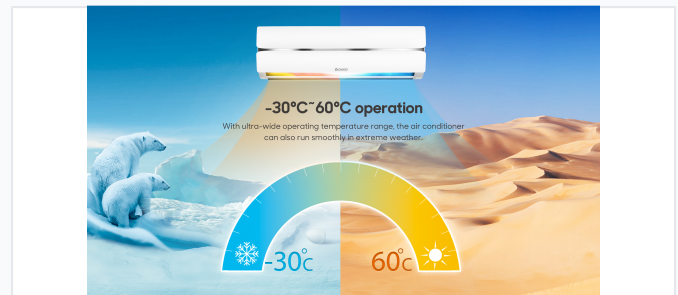
Reliable performance in extreme climates from -30°C to 60°C.