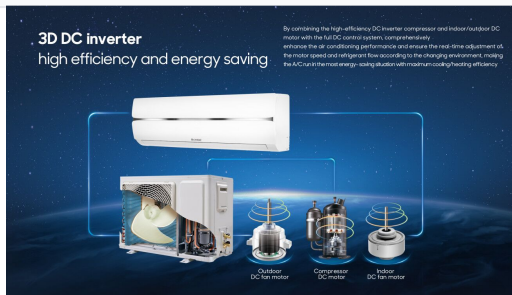
Full DC control system optimizing compressor and motor speed for maximum efficiency.