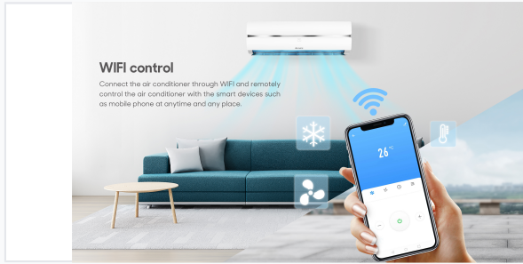
Remotely manage temperature and settings via mobile devices.