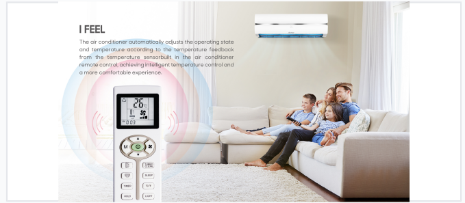
The remote control acts as a temperature sensor for localized comfort.