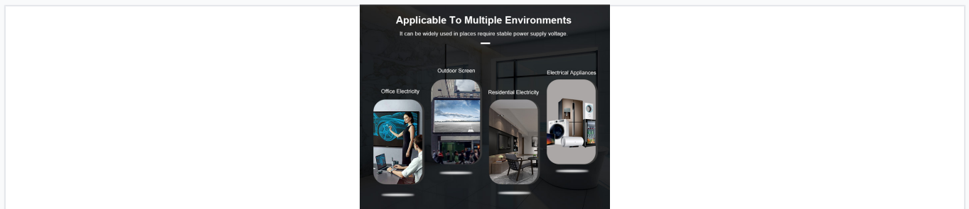
Versatile design suitable for office, residential, and appliance protection.