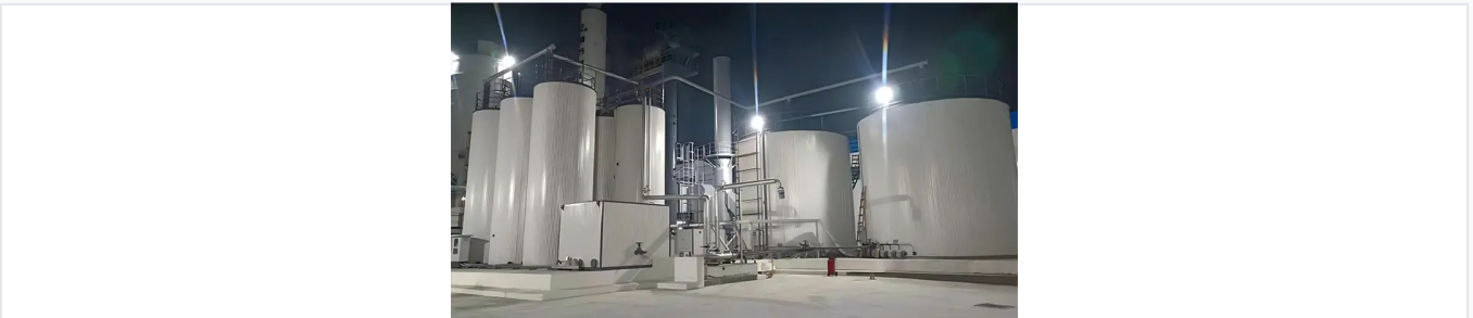
A vertical bitumen tank designed for the storage and heating of bitumen, featuring an insulated cylindrical design for optimal temperature control.