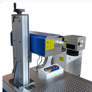
High-accuracy galvo scanner head designed for fine, intricate marking tasks.