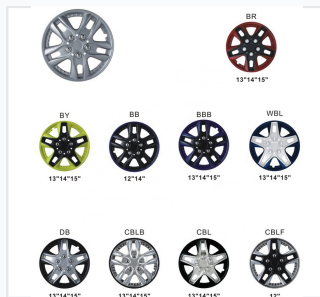
Various wheel cover styles and color options.