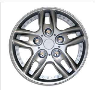
Standard silver finish hubcap design available in multiple sizes.