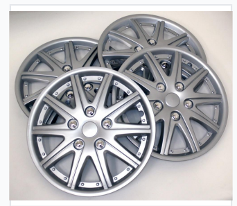
Durable plastic construction with silver finish.