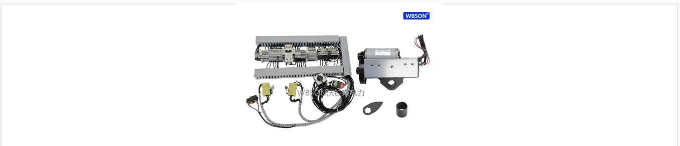
Complete WBS020 motor control kit components for industrial switchgear applications.