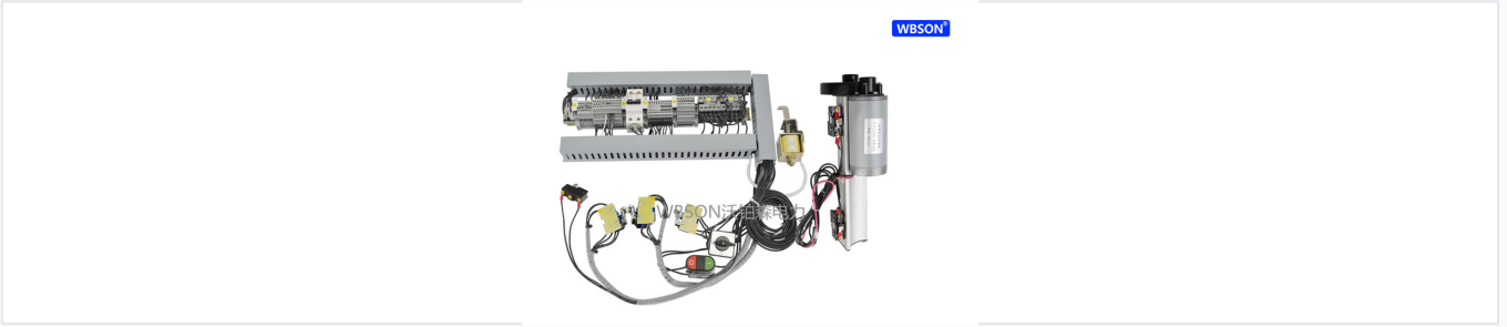
Control panel and motor assembly featuring pre-wired terminals for simplified installation.