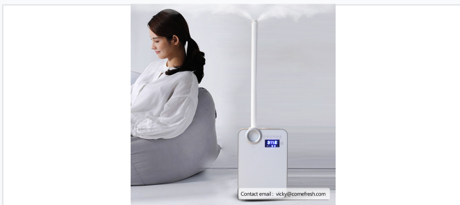
Dual mist nozzle design for even distribution