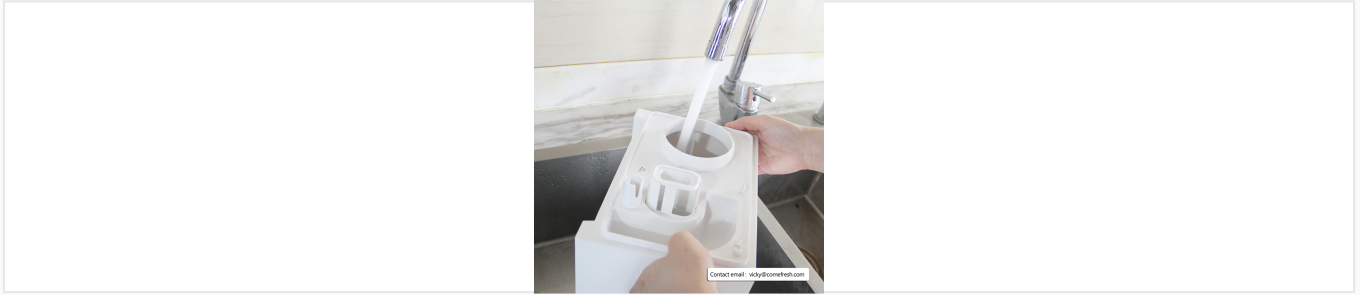
Easy-access large opening water cover