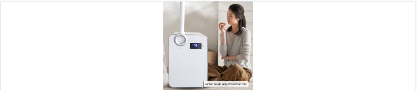
Modern design integrated into home environment