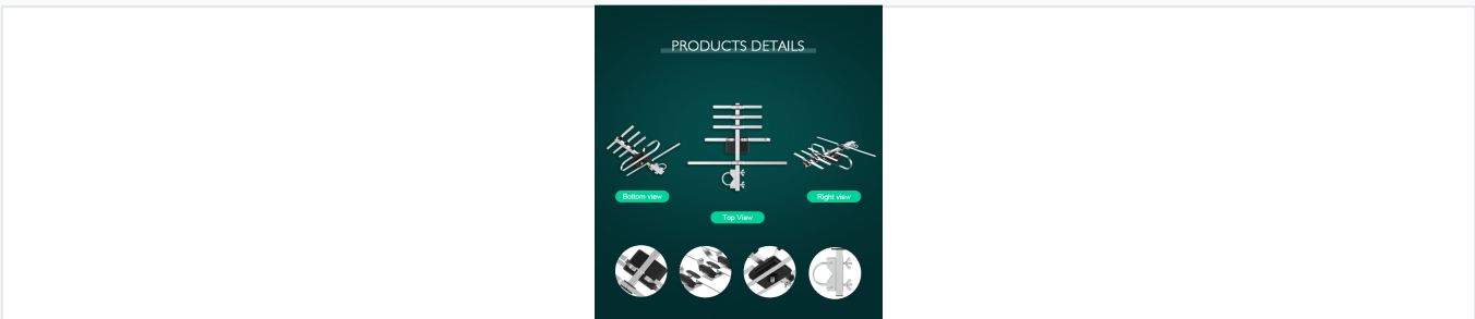
Detailed views from top, bottom, and side perspectives showing the professional structural design.

Signal Performance • Full HD Digital TV signals • Local UHF signals • High impedance matching • Strong signal reception