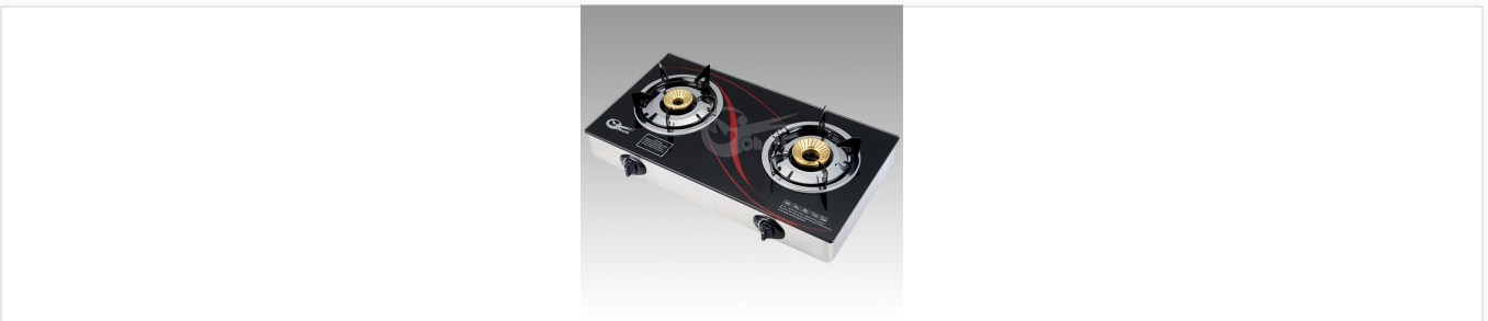
Modern tempered glass cooktop featuring efficient burner design.