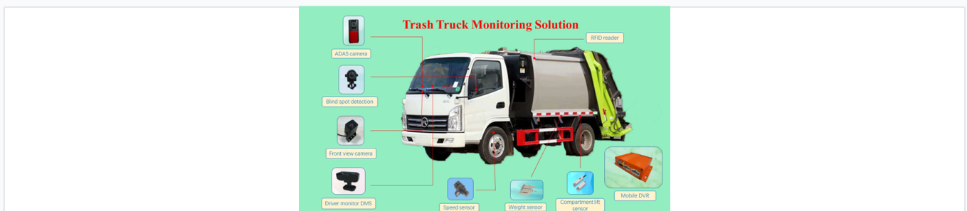
Overview of the integrated AI monitoring solution, showing cameras, sensors, and DVR connectivity.