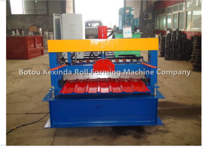
High-precision rollers designed for consistent trapezoidal profile shaping.