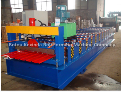
Precision forming section with hydraulic cutting mechanism for accurate length control.