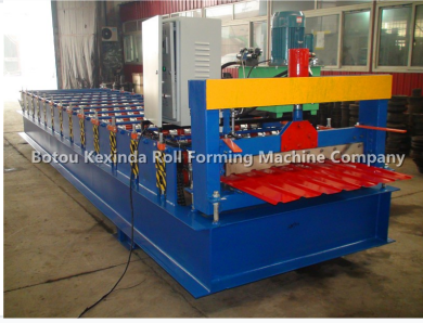
Robust machine frame featuring multiple forming stations and integrated control panel.