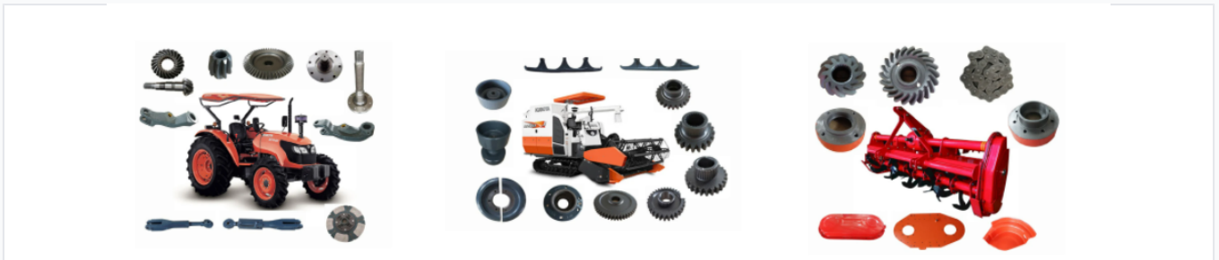
Overview of essential tractor components and spare parts for agricultural machinery maintenance.