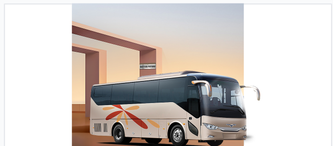
High-performance coach designed for reliable tourism and charter applications.