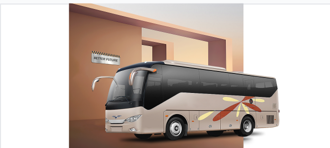
Modern aerodynamic exterior design with stylish two-tone finish.