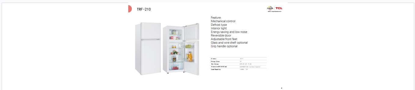
Product specifications and design overview diagram.