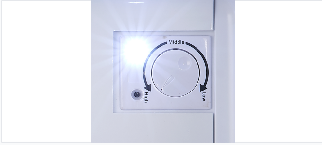
Easy-to-use temperature adjustment with High, Middle, and Low settings.