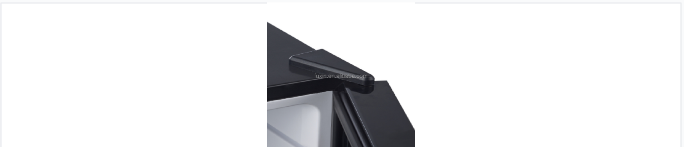
Sleek black exterior with energy-efficient interior LED lighting.