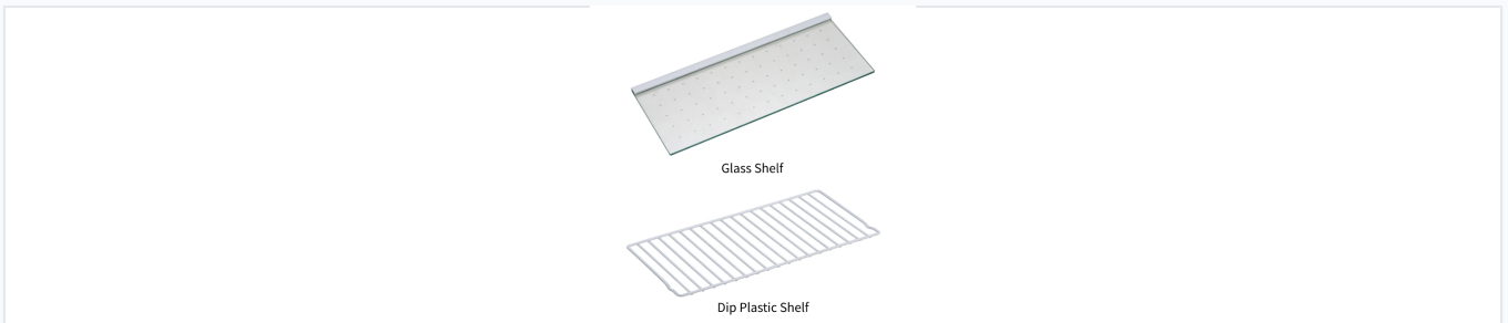
Versatile storage options including ventilated glass and durable plastic-coated wire shelves.