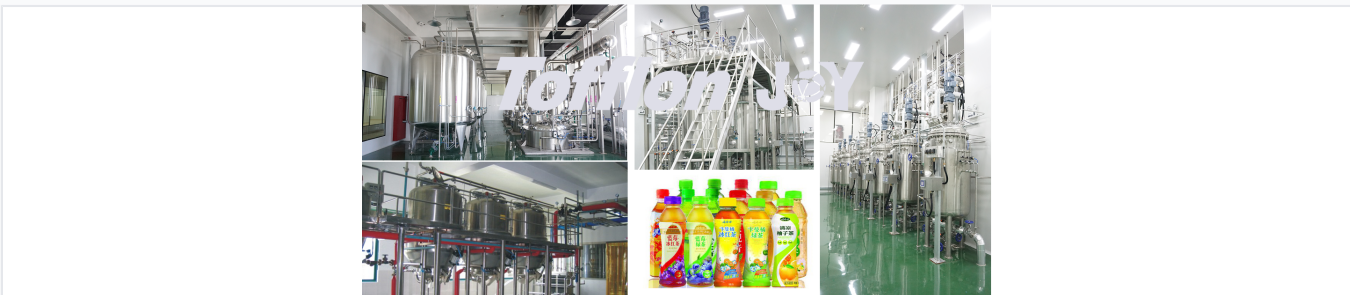
Comprehensive industrial processing setup designed for high-hygiene tea beverage production.