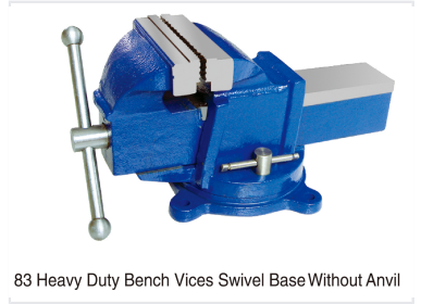
83 Heavy Duty Bench Vices Swivel Base Without Anvil

This heavy-duty bench vise features a swivel base for versatile positioning. It is constructed with a durable casting iron body and casting steel anvil for secure clamping and impact operations.