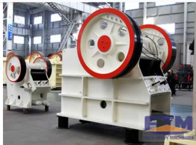
A robust and efficient jaw crusher designed for high-capacity primary and secondary crushing.