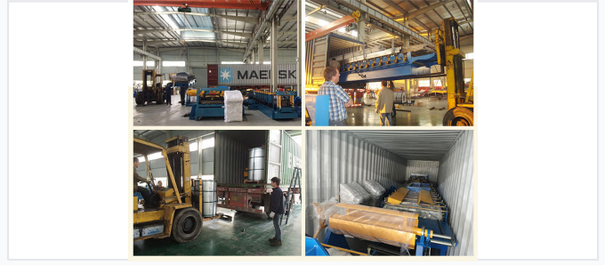
End-of-line stacking mechanism for high-volume manufacturing.