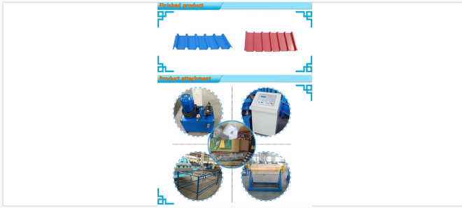
Machine setup showing finished decking output and attachment versatility.