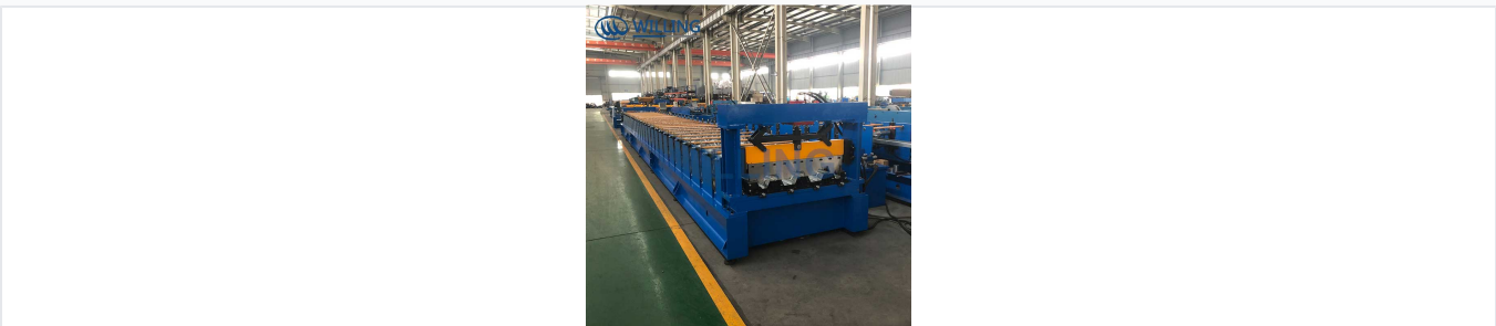
Precision forming station for consistent decking profiles.