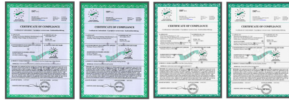
BAR STRAIGHTENER BENDING HOOP MACHINE CUT-OFF MACHINE BENDING MACHINE

Official certificates of compliance ensuring the machinery meets international safety and quality standards.