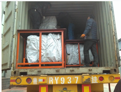
Secure industrial packaging using iron frames and wooden boxes.