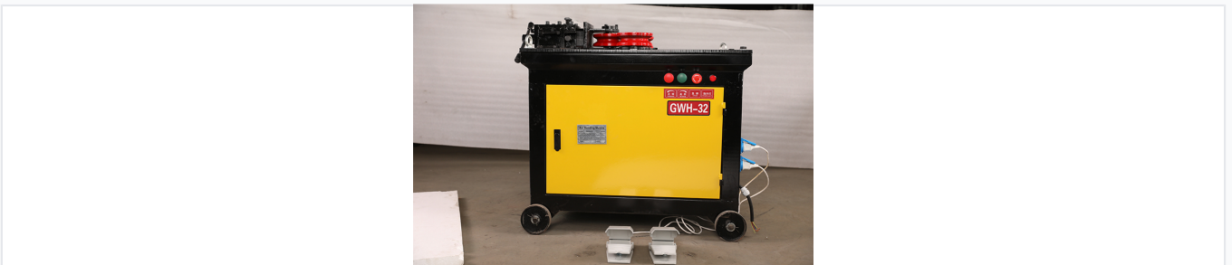
Heavy-duty steel bar curving machine for industrial applications.