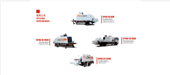
Suitable for high-rise buildings, bridges, and road construction projects.