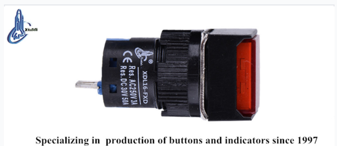
Square LED push button design for standard control panels.