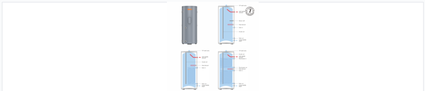
Tank configuration featuring relief valves, sensor wells, and solar circulation ports.