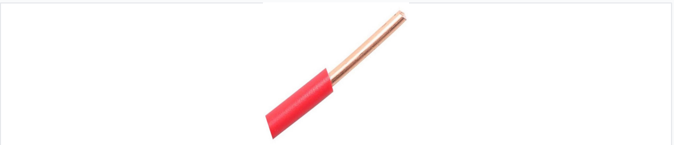
Standard H07V-U NYA solid copper PVC insulated wire