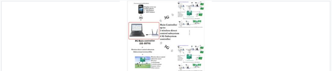
Advanced connectivity diagram featuring remote management capabilities.