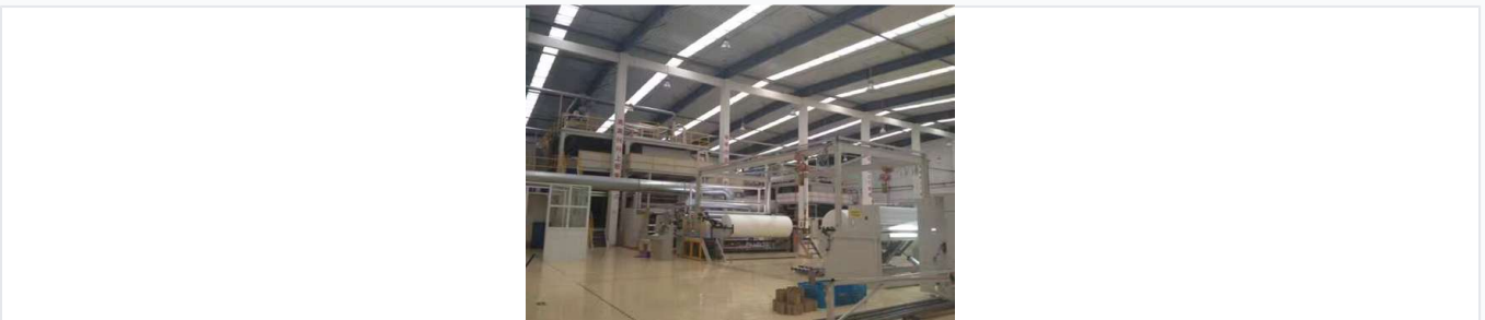
A complete SMS production line showing the integration of spunbond and meltblown units for composite fabric manufacturing.