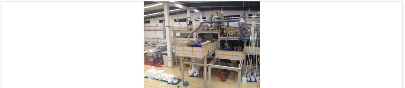
Detailed view of the multi-layer extrusion system and calendaring units designed for precise web formation.