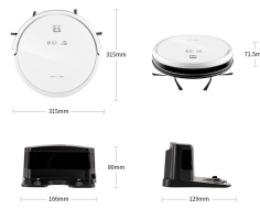
Appearance and Size

Compact design profile allows the robot to clean under furniture and store easily on its dock.