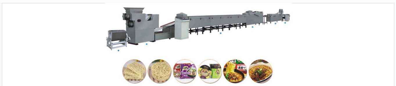
A compact and efficient production system designed for automated noodle manufacturing.