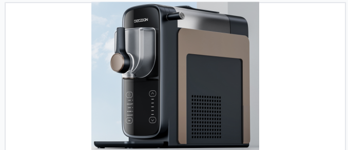
Modern design featuring a transparent container and dispensing lever.