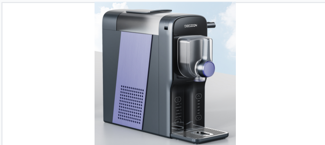
Intuitive control panel with settings for various frozen beverages.