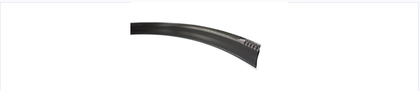
High-quality polyethylene drip tape designed for uniform water distribution.