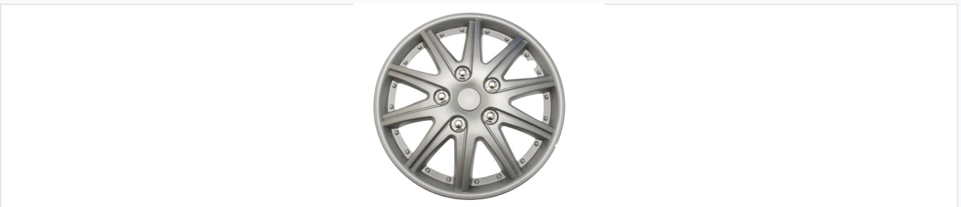
High-quality center hubcap design with a sleek silver finish.