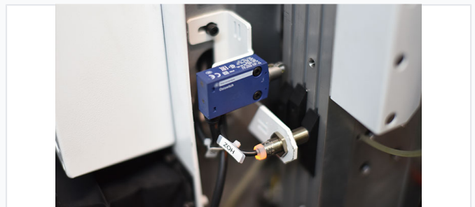
Advanced sensor technology for accurate positioning and material detection.