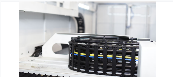
Robust cable carrier system ensuring smooth and reliable operation.