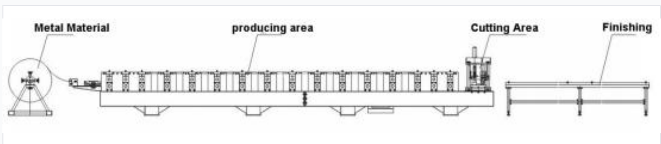
Workflow overview showing material feeding, forming, and automated cutting stations.