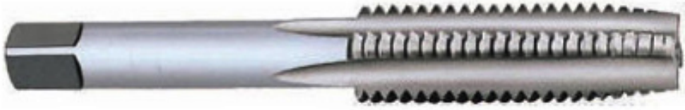
Precision-ground tap sample processed by the machine.