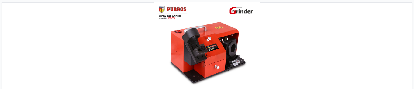
The PG-Y5 grinding unit designed for workshop integration.