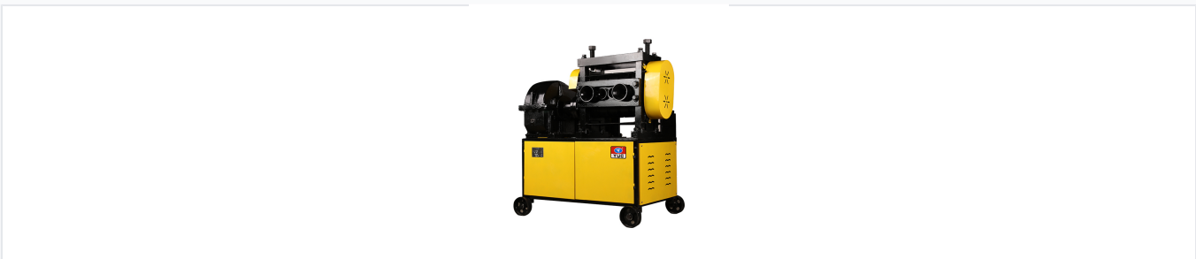
Heavy-duty scrap bar straightener for industrial metal processing.