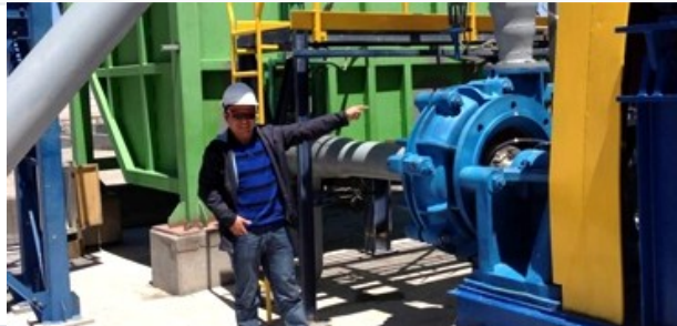
High-efficiency pump unit suitable for harsh dredging environments.