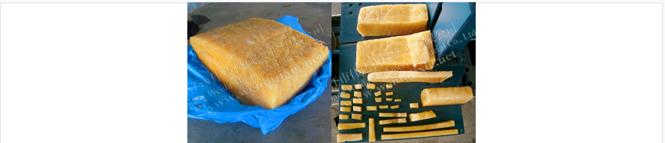
The rotating-disc cutting machine effectively processes raw rubber blocks into uniform slices and granules.