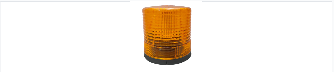
High-visibility amber lens with rotating mechanism for 360-degree coverage.