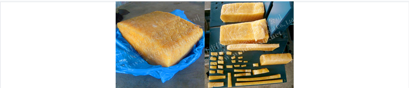
Versatile output options including blocks, slices, granules, and strips.