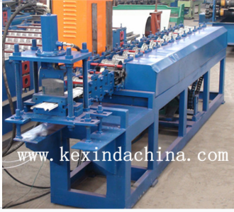
Precision forming stations for consistent slat profiles.