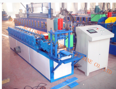
Integrated control panel for easy parameter adjustment.