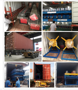
Robust construction ensures durability and consistent output.