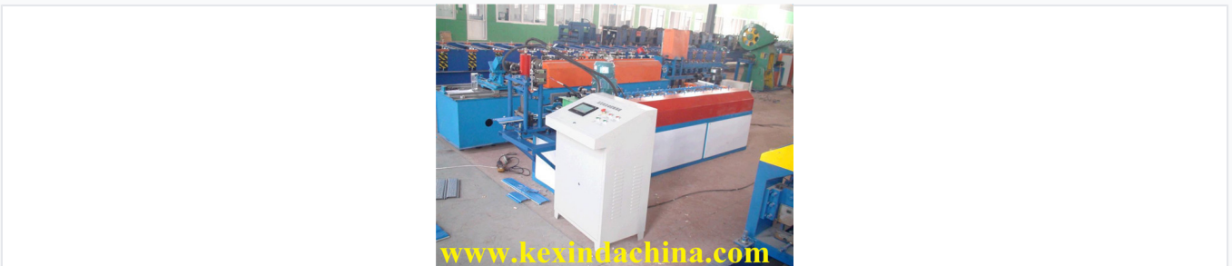
Compact and efficient design suitable for commercial and industrial manufacturing.