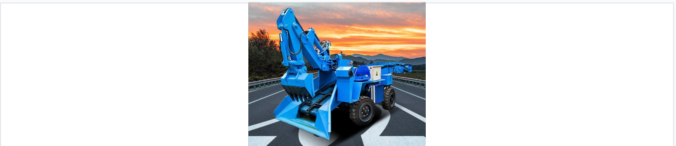
A high-quality roadway maintenance machine designed for efficient removal of slag and debris.