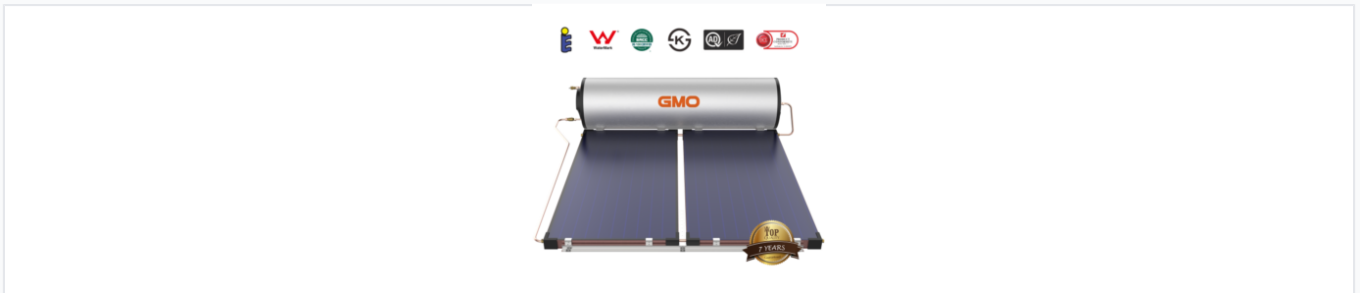
Integrated solar thermal system design for efficient, renewable hot water delivery.