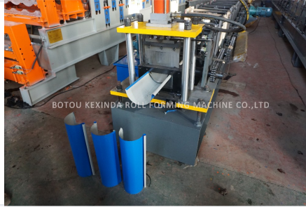
Precision-engineered rollers designed for consistent gutter profile shaping.