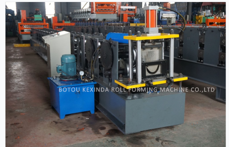
Integrated hydraulic system ensures clean and accurate cuts for every gutter section.