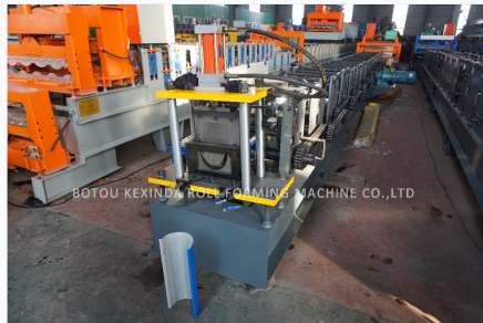
User-friendly touch screen interface for monitoring and adjusting production parameters.