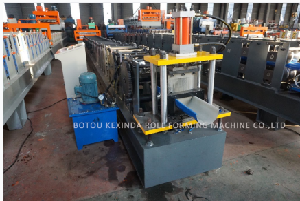
Complete production line setup including uncoiler and forming stations.