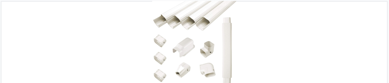
Modular fittings including elbows, joints, and caps for versatile routing configurations.