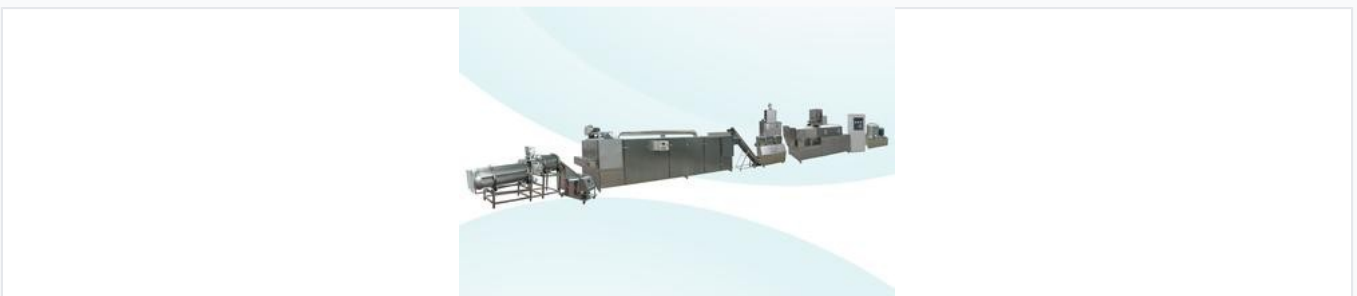
Automated production line constructed from high-quality stainless steel for hygiene and durability.