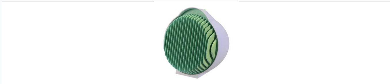
Engineered for energy efficiency and reliable temperature control.