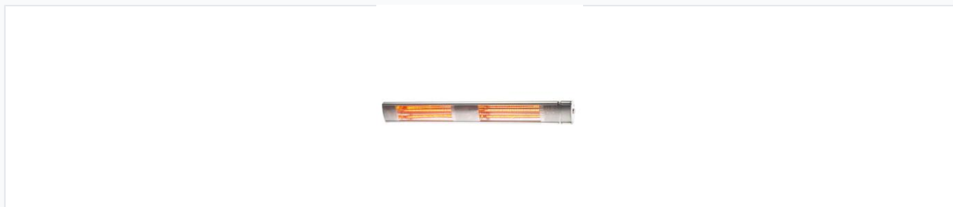
Efficient space heating for modern home and office environments.