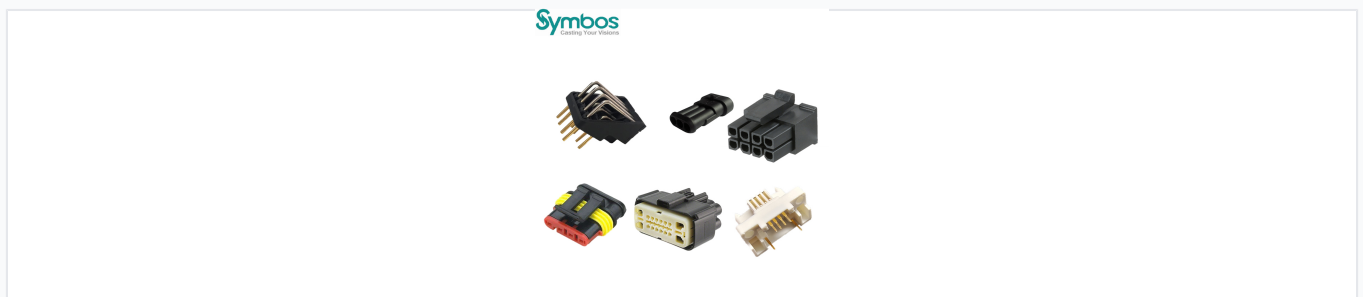
Example of high-precision parts produced using our injection molding solutions.