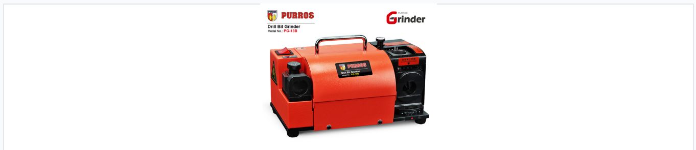
A compact, portable design for convenient workshop and on-site use.