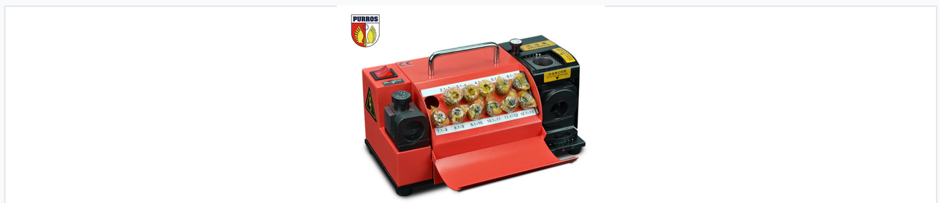
Clear markings and adjustment settings for precise drill bit diameter selection.